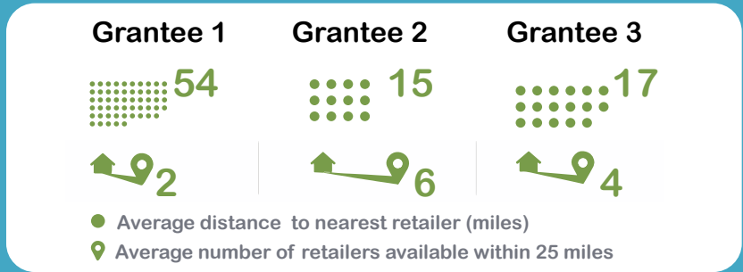
The availability of authorized retailers and travel distances to them were key metrics in the Abt evaluation team's spatial analyses.

✓ Use spatial analysis and mapping data. States, Tribal Organizations, and Territories need to know where eligible households live, how far they have to travel to shop at a participating store, and whether transportation is available. They may need to enlist more retailers.