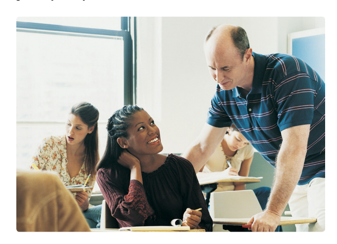
Evaluation of Round 4 Trade Adjustment Assistance Community College Career Training Grants (TAACCCT)

In an effort to expand registered apprenticeship in the United States, the American Apprenticeship Initiative (AAI) was created, providing $175 million in five-year grants to 46 grantees across the country. To understand the operation and effects of these grants, the Employment and Training Administration (ETA) of the U.S. Department of Labor (DOL) contracted with Abt Associates to conduct an evaluation to build evidence about the effectiveness of apprenticeship for participants and employers, as well as lessons for developing and operating these grant programs. Abt Associates is conducting an implementation study, outcomes study, and a return on investment study to evaluate this initiative. All 46 AAI grantees are included in this high profile and high priority study for DOL.