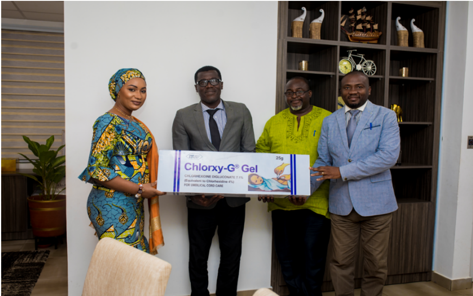
DrugField Pharmaceuticals presenting Chlorxy-G gel to the second lady of Ghana, Mrs. Samira Bawumia