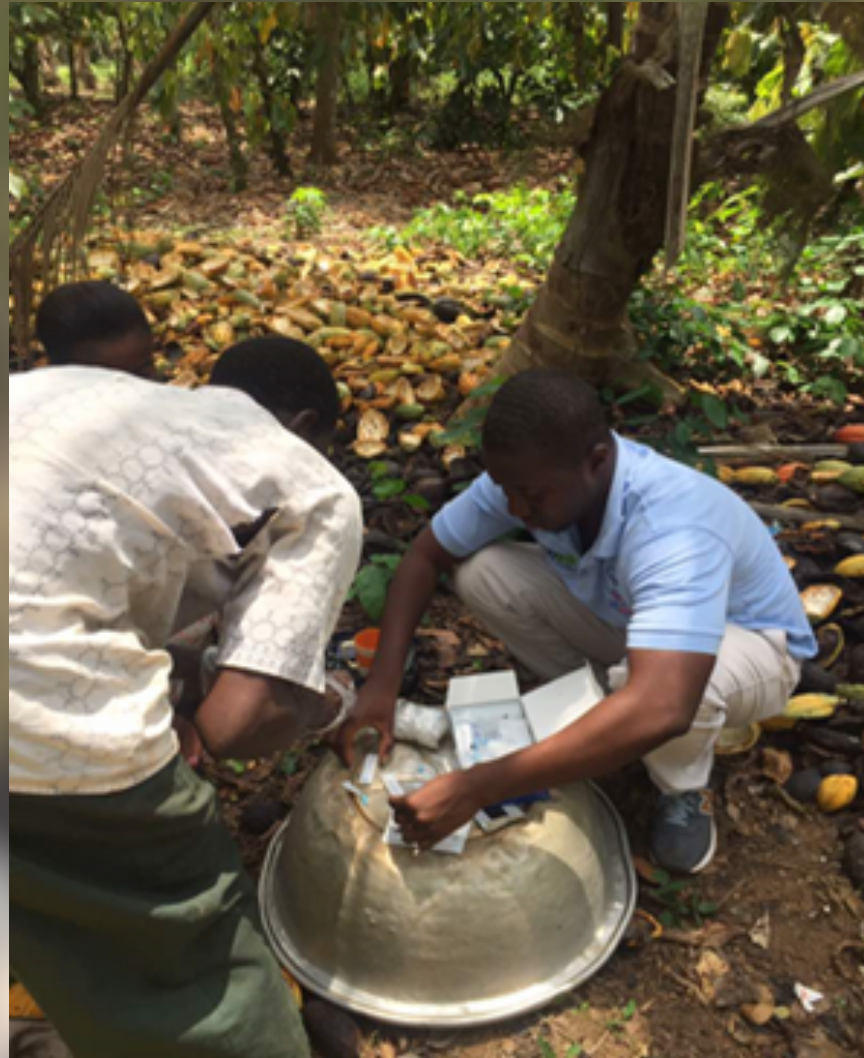
Supportive supervision on malaria RDT with OTCMS