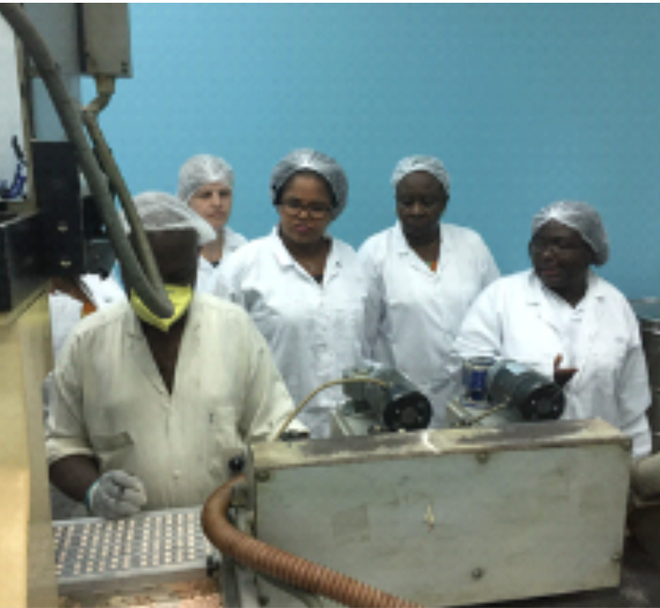
Site inspection at Phyto – Riker Pharm. in the manufacturing of Co-packaged ORS/Zinc product