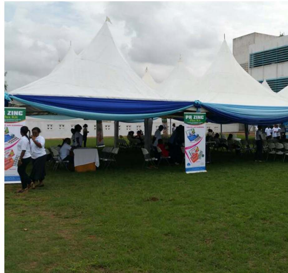
Launch of Phyto–Riker Pharmaceuticals Limited PR Zinc plus kit