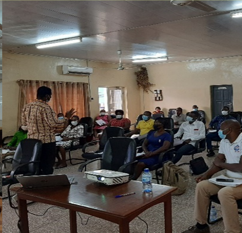
Training of facility data managers on DHIMS2 data reporting