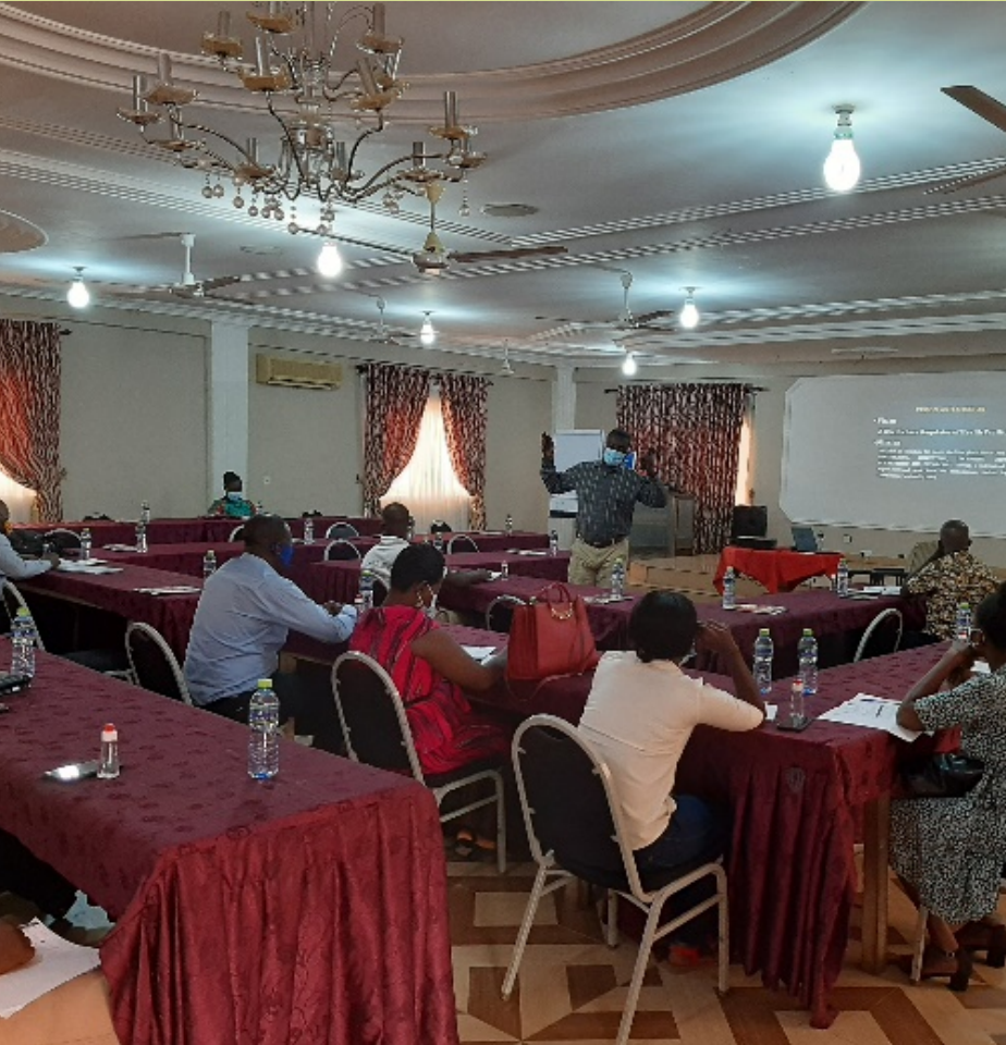
Sensitization of facility owners on the need for DHIMS2 data reporting